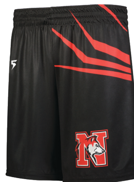
Cut Shot II