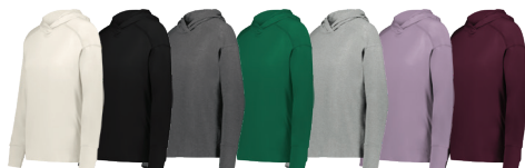
BIRCH 907 BLACK 080 CARBON HEATHER 083 DARK GREEN 035 GREY HEATHER 013 LAVENDER J63 MAROON 745