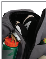
Inside divider for shoes or damp items