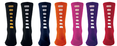
BLACK/GOLD 421 BLACK/WHITE 420 NAVY/WHITE 301 ORANGE/WHITE 320 POWER PINK/WHITE 468 PURPLE/WHITE 450 RED/WHITE 400