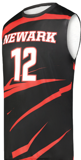
Cut Shot II