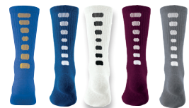
ROYAL/GOLD 281 ROYAL/WHITE 280 WHITE/BLACK 226 MAROON/WHITE 380 GRAPHITE/WHITE R04