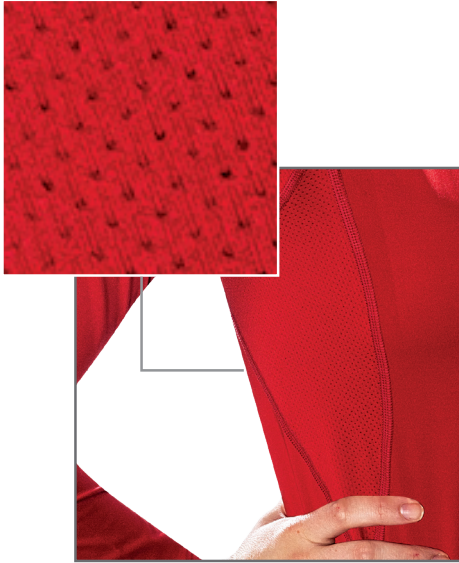
Wicking mesh insert