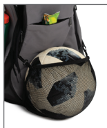
Mesh ball holder fits volleyball, soccer or basketballs