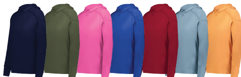
NAVY 065 OLIVE 039 ORCHID 47V ROYAL 060 SCARLET 083 STORM 932 TERRACOTTA J46