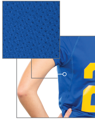
Wicking mesh insert