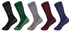
BLACK 080 DARK GREEN 035 GRAPHITE 059 MAROON 745 NAVY 065