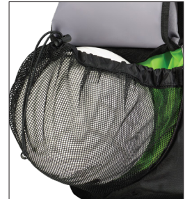
Front pocket with corded zipper pull with hidden inside mesh ball holder that fits volleyball, soccer ball, or basketball