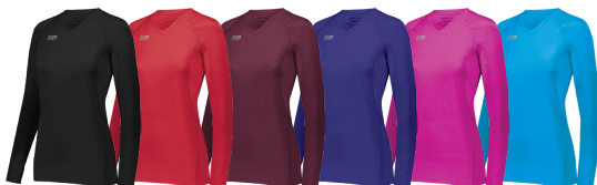
BLACK 080 SCARLET 083 MAROON 745 PURPLE 747 POWER PINK 809 POWER BLUE 812