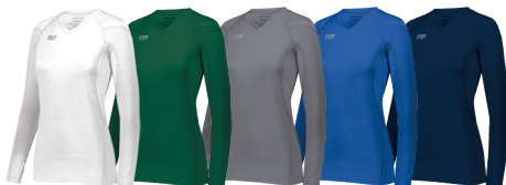
WHITE 005 FOREST 038 GRAPHITE 059 ROYAL 060 NAVY 065