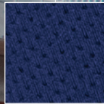
Wicking mesh insert