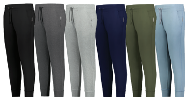
BLACK 080 CARBON HEATHER E83 GREY HEATHER 013 NAVY 065 OLIVE 039 STORM 932